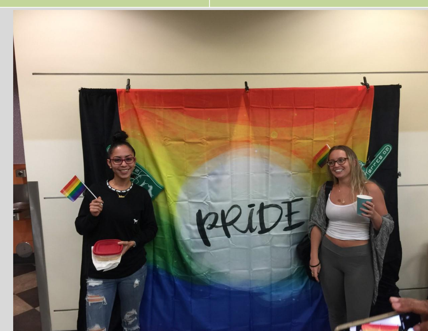
Showing our Pride!