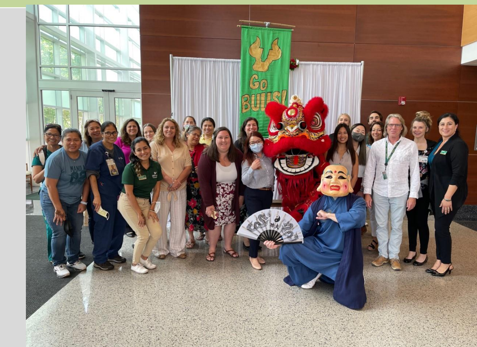
APIDA Heritage Celebration Lion Dance

Addressing DEI & taking action to build nursing capacity to achieve health equity.