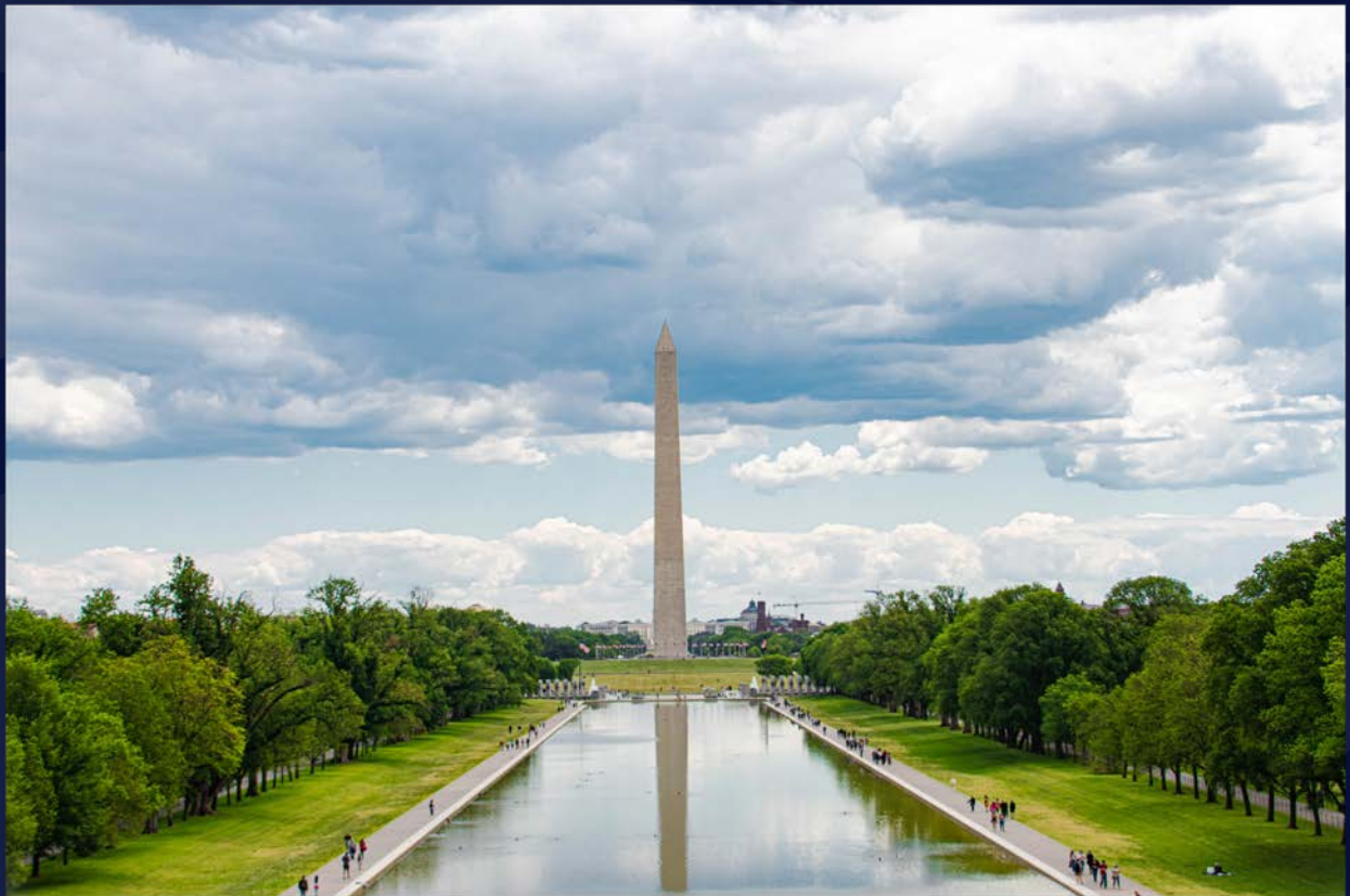
Exhibit & Sponsorship Prospectus